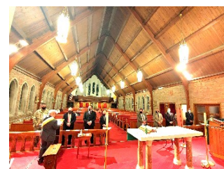
Photos from the in-person Exemplification Degree Ceremony for District 16.