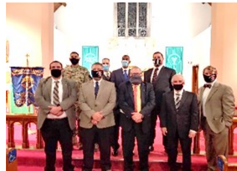
Candidates Under the Exemplification Degree