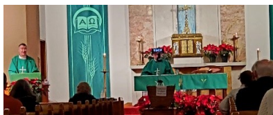
The Council provides a weekly livestream of Mass for the

Continued Service to Parish: The Council continues to work with the Parish to ensure a safe celebration of Saturday evening and Sunday Masses. Knights continue to volunteer time every weekend covering all four (4) Masses to greet Parishioners, usher for communion and dismissal, sanitize the church, and ensure social distancing and facial coverings are in place for a safe celebration of Mass. The Council also hosts a livestream of the 9:30 am mass every Sunday on the Council YouTube Channel