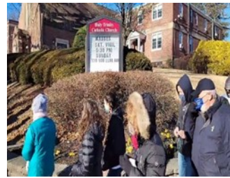
Knights, Parishioners, Family, and Friends participate in a Mass and March for Life at Holy Trinity.