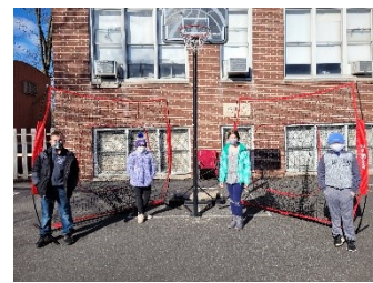
Students had an opportunity to compete outside in the Council Free Throw Championship.