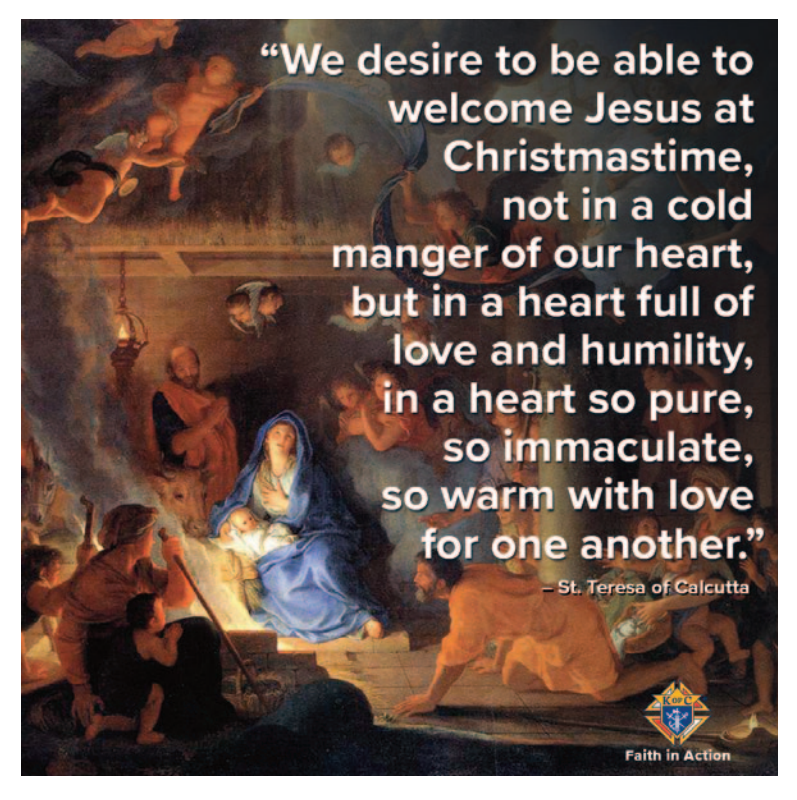
Any links to third-party sites outside of the Knights of Columbus are provided for information purposes only. This is not an endorsement of the service providers.

Earlier this month, the Supreme Council announced changes to the structure of council meetings. Now, our revised and expanded guidebook provides everything council officers need to plan and host meetings in-person or virtually, especially with COVID-19 restrictions. To learn more, visit kofc.org/fraternaloperations.