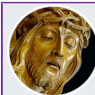
St. John the Baptist Catholic Church