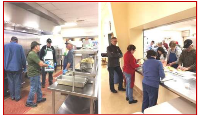
Making golabki for the Polish Dinner

The 2020 COAL raffle is off to a good start in its first month, but we have a ways to go to meet and hopefully exceed the prior 2018 campaign. To date 229 members have received 3 books in the February Knight Edition mailing, and as of this mailing 29 members have participated purchasing 110 books. The COAL raffle proceeds benefit both the State Scholarship fund and also our Council #8891, with roughly $2.75 a book coming back to Council #8891 so we can continue support the many charitable endeavours our council is involved in.